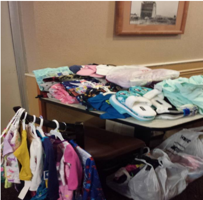
All those great jammies!